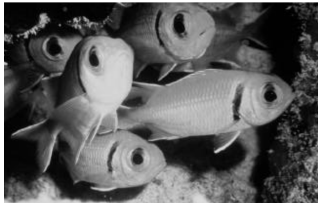
Blackbar soldierfish huddle within a coral reef.

Coral reefs are the centerpiece of three sanctuaries. The Florida Keys sanctuary includes the third largest coral reef