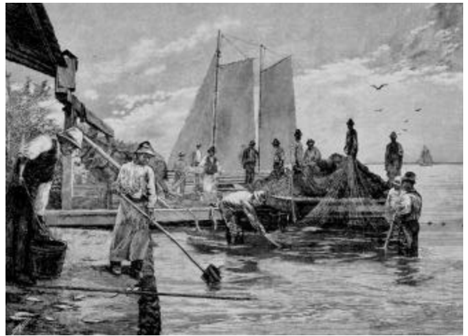
Haul-seine fishing at Sutton Beach, Albemarle Sound, North Carolina. Boating the seine. From a photograph.

NOAA can also take steps that will make the sanctuary