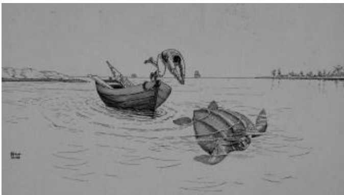
Diving for logger-head turtle; Morehead City, North Carolina.

The sanctuary program has a promising future if it can show that it produces results. Every year, new technologies make it easier for us to go deeper into the ocean and to see its wonders. Scuba-diving, whale-watching, the use of small remotely operated submersibles with television cameras, live underwater video telecasts via the Internet to classrooms—these and other ways to bring people into personal contact with the ocean are evolving rapidly. The beauty and richness of marine life in the sanctuaries attract attention from educators, scientists, tourists, and residents of nearby communities. Public interest in and support of the program is bound to grow.