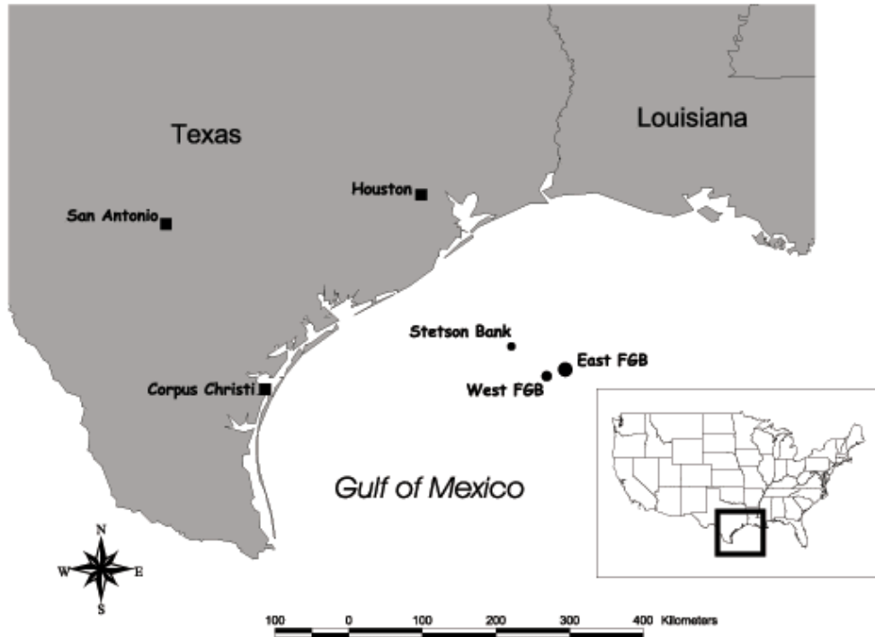
Figure 3-2 Flower Garden Banks National Marine Sanctuary

greatly impacts coastal hydrography in the northwestern Gulf. At peak discharge, the Mississippi River alone can transport more than 100,000 m 3 of fresh water per second into the Gulf.