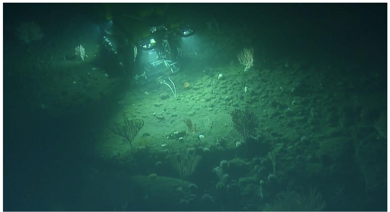
Deep-sea corals, R/V Nautilus.

This management plan document includes 11 action plans covering issue-based and programbased themes intended to guide ONMS over the coming five to 10 years. Each action plan contains strategies with multiple activities to achieve goals.