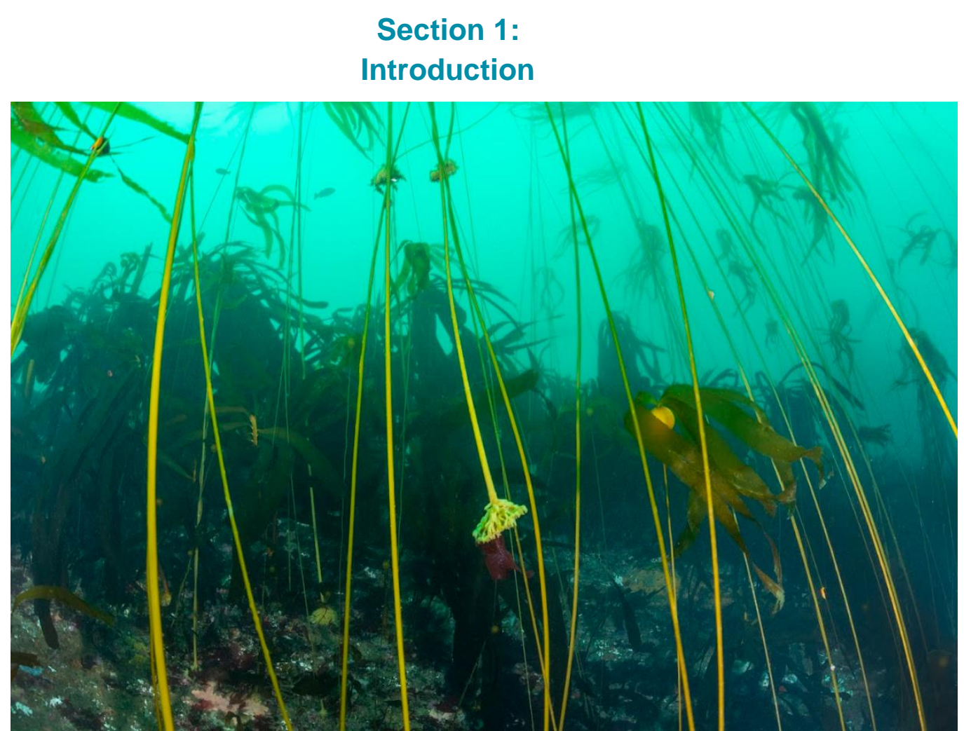
Spooner Reef.