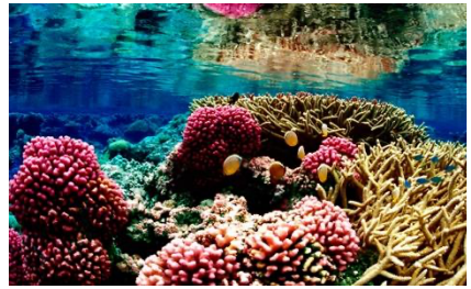
Branching corals grow on a vibrant shallow coral reef at Palmyra Atoll National Wildlife Refuge.

The proposed sanctuary would honor the ancestral, historical, and cultural connections to the Pacific Remote Islands and the surrounding open-ocean waters. recognize the importance of Indigenous knowledge, language, stories, and cultural connections between lands, waters, and peoples, and celebrate distinct cultures. Native Hawaiian. Samoan, Chamorro, Carolinian, and many other Pacific Island Indigenous peoples have voyaged across this vast expanse of the Central and Western