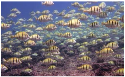
Thousands of convict tangs school in the shallows off Jarvis Island.