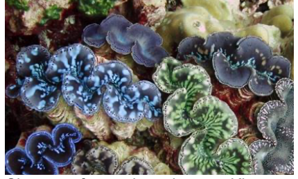
Closeup of rare giant clams at Kingman Reef National Wildlife Refuge.

The region's diverse habitats and pristine reefs provide a haven for a variety of fish, invertebrates, seabirds, sea turtles, and marine mammals – many found nowhere else in the world – and are an ideal laboratory for monitoring the effects of climate change.