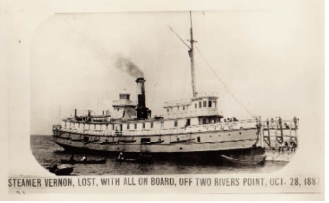
The steamer Vernon sunk during a storm in 1887 with the loss of 48 lives.

other sanctuaries to protect underwater cultural resources, with an additional regulation that prohibits grappling and anchoring on shipwreck sites. Authorities related to natural resources and their management remain with the state of Wisconsin. The proposed sanctuary would be co-managed by NOAA and the state of Wisconsin.