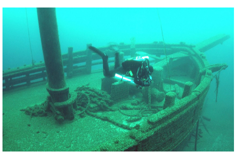
A diver swims over the schooner Walter B. Allen, sunk in 1880.

NOAA's preferred regulatory approach would adopt regulations similar to those used in