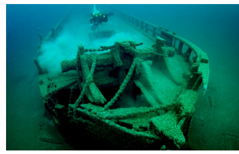
Built in 1843, the schooner Home is one of the oldest shipwrecks discovered in Wisconsin.