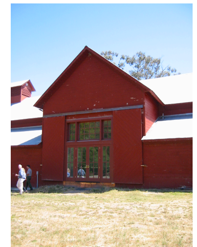
Entrance to CBNMS Headquarters At the “Red Barn”