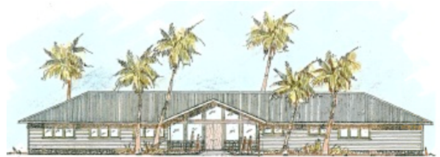
Earlier Proposed Joint Fagatele Bay National Marine Sanctuary/National Park of American Samoa Visitor Learning Center. This proposal is now tabled, but the sketch gives a flavor of the style of waterfront building contemplated in Pago Pago.