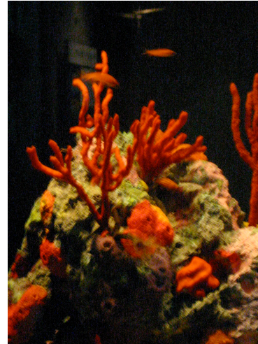
FGBNMS coral display at Audubon Aquarium of the Americas, New Orleans, LA

A Sanctuary vessel is maintained at Freeport, TX, some 40 miles southwest of Galveston.