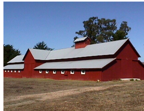
The “Red Barn” at Bear Valley, Point Reyes National Seashore