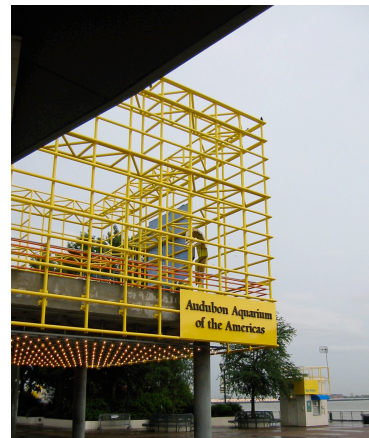
Entrance to Audubon Aquarium of the Americas, New Orleans, LA