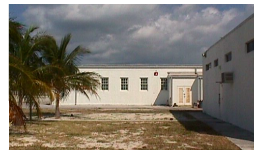
Existing Key West buildings to be converted to Nancy Foster Environmental Center