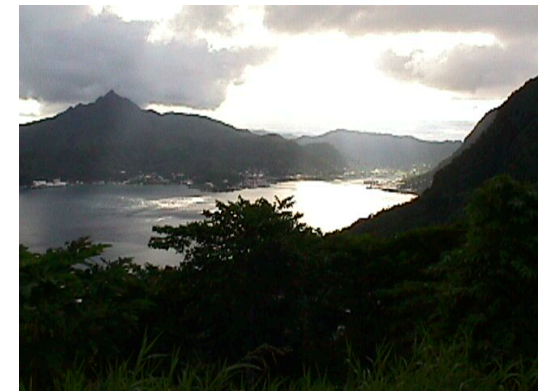
Pago Pago Harbor Tutuila, American Samoa