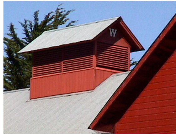
Cupola of "Red Barn"

The new headquarters installation for the CBNMS, as well as the requests for funding, are quite modest efforts, compared to other Sanctuaries in the system. Nevertheless, the good cooperative relationship with the PRNS offers the best opportunity for Sanctuary program growth and facility development, if only because most of the shore side locations that might house CBNMS facilities are within the National Seashore. The development of exhibits at the PRNS Visitor Centers should be undertaken as soon as possible.