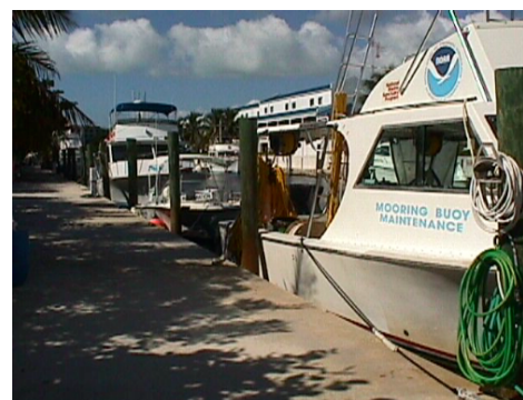
FKNMS vessels in canal at potential relocation site for Upper Keys Office near Key Largo, FL