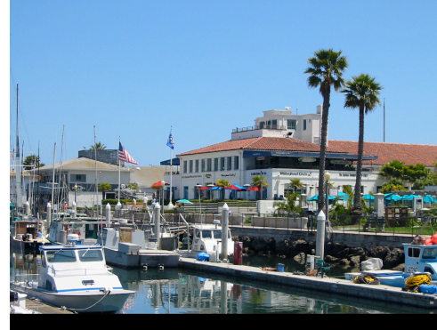
Santa Barbara Marina. Large Tile Roof Building is Maritime Museum . CINMS Headquarters is located on rear side of Museum

The Sanctuary maintains exhibits at the Oxnard headquarters of the Channel Islands National Park through cooperation with National Park Service. Exhibits are now somewhat shopworn and deteriorated; Phase II of Long Range Plan calls for upgrading these displays.