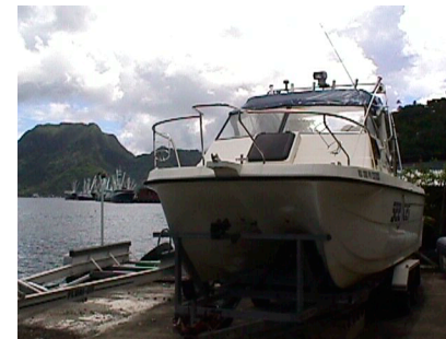
FBNMS Vessel and Trailer at Pago Pago Waterfront