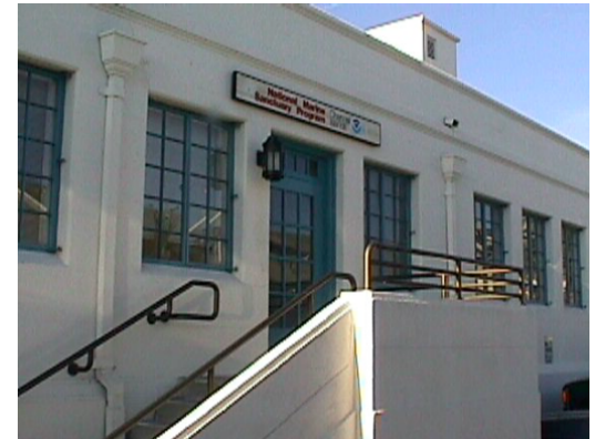
Entrance to CINMS Headquarters Santa Barbara Marina