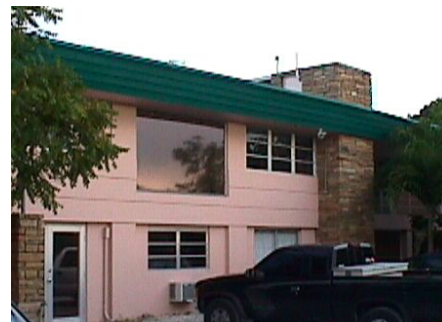
Exterior of FKNMS Headquarters Building, Marathon, FL