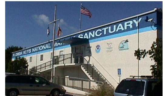
Upper Keys Regional Office Key Largo, FL