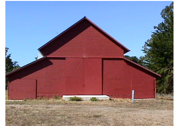
End of "Red Barn" Now Entrance to Point Reyes National Seashore Conference Area