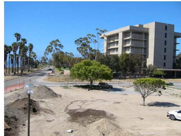
University of California at Santa Barbara Campus Site of Proposed CINMS Headquarters would be immediately in front of the white building, facing the Pacific Ocean