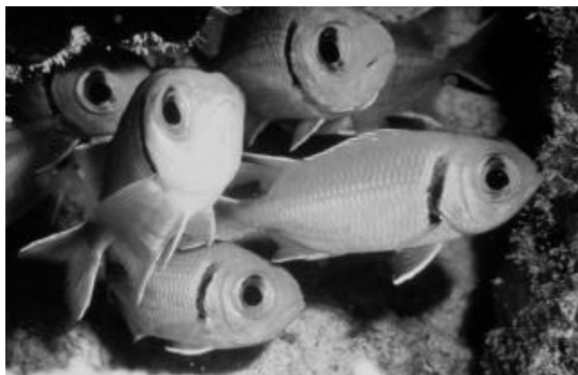
Blackbar soldierfish huddle within a coral reef.

Coral reefs are the centerpiece of three sanctuaries. The Florida Keys sanctuary includes the third largest coral reef