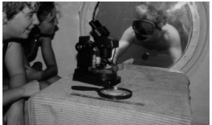
Snorkeler visits the Marine Resources Lab now in a lagoon off Key Largo, FL. Location: Key Largo, FL.

During these early years, a very small staff in Washington wrote cooperative agreements with state agencies or with the National Park Service to manage the sites. In the 1980s, the sanctuary program began posting NOAA Corps officers for two-year assignments, a practice that continues at five sites today (Florida Keys, Gray's Reef, Channel Islands, Monterey Bay, and Olympic Coast).