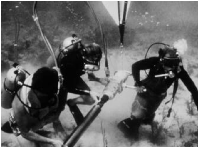
Scientists preparing to drill into a coral reef to study climate over the past 20,000 years.

Every organization, like every family, has its own way of operating. To be effective, members of the group must share basic agreements about what is important, how people should behave, and how decisions are made. The federal land management agencies offer one possible model for how the sanctuary program could organize itself to get work done. But the sanctuary program is slowly developing a different and indeed more modern model.