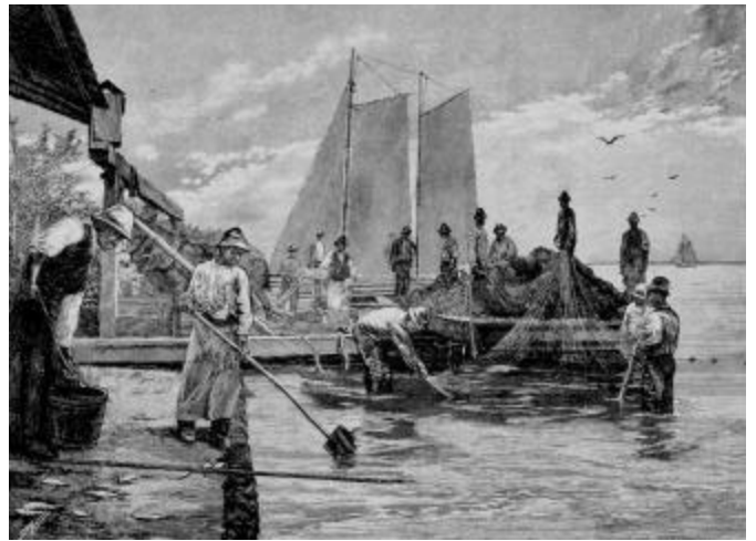
Haul-seine fishing at Sutton Beach, Albemarle Sound, North Carolina. Boating the seine. From a photograph.

NOAA can also take steps that will make the sanctuary