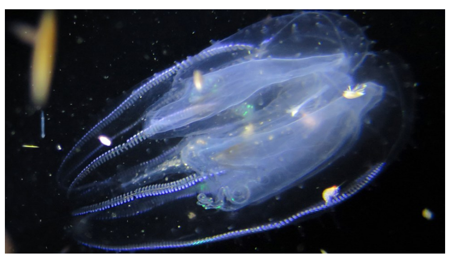
A bioluminescent comb jelly (Ctenophore) at Hawaiian Islands Humpback Whale National Marine Sanctuary. What evolutionary clues do they contain?