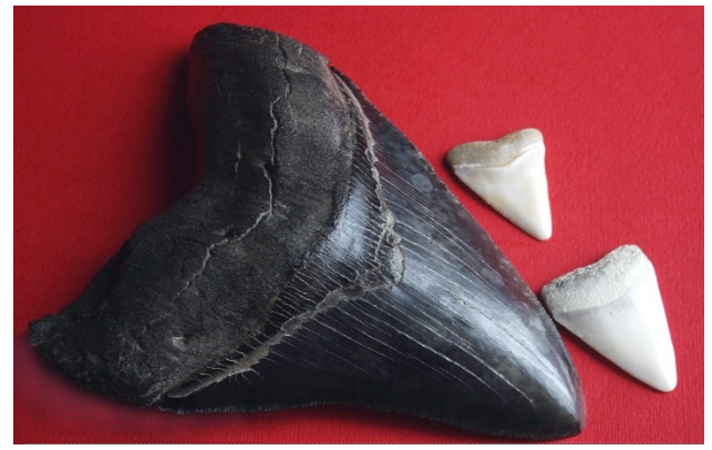
A megalodon tooth with great white shark teeth

Importantly, our national marine sanctuaries harbor the dynamic and diverse organisms that descended from ancient ocean-dwellers. In fact, most of the major groups that exist on Earth are found exclusively in the ocean and the diversity of major groups of organisms is much greater in the ocean than on land. Studying the DNA of existing species provides clues about the relationships between organisms and the very beginnings of life on Earth.