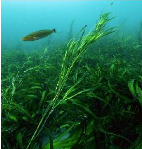
An eelgrass meadow.