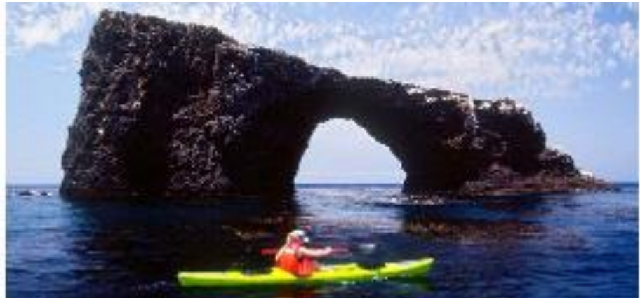
A kayaker in Channel Islands National Marine Sanctuary.

Ocean Literacy Principles 1, 5, 6, 7 Climate Literacy Principle 7