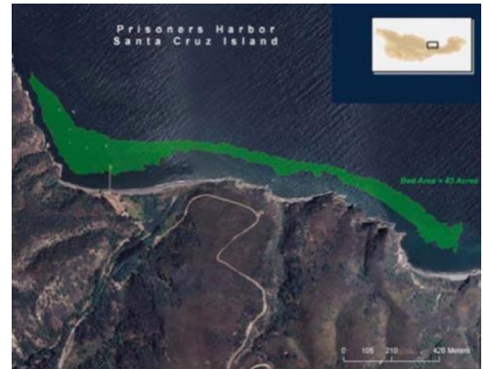
A map of eelgrass meadows in Prisoners Harbor.

**Note: Teach students that 1 1/2 mm is 1.5m when shouting out Diver #1’s location so it’s easy for Diver #2 to record the point on the graph.