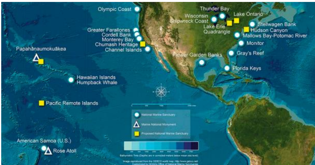
A map of the National Marine Sanctuary system in the U.S. and its territories.