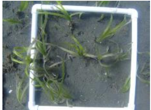
A quadrat can be used to monitor eelgrass beds.