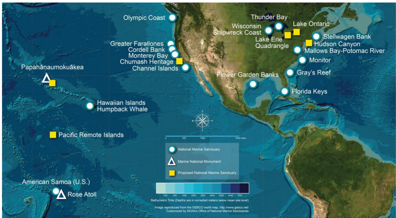
A map of the National Marine Sanctuary System in the U.S. and its territories.