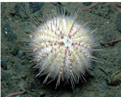
Sea urchins are a vital part of the food web.