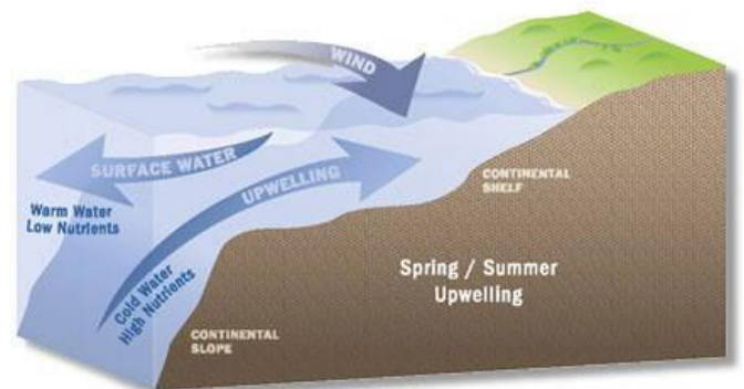
Coastal upwelling is the process by which prevailing summer winds carry surface waters offshore. They are replenished by cold, deep water, carrying nutrients from deep in the sea to the sunlit shallows.

During the summer months, upwelling results in the growth of phytoplankton. Upwelling is a wind-driven process where cold, nutrient-rich water from the ocean floor moves upwards to replace warmer, nutrient-depleted surface waters. Upwelling in Olympic Coast National Marine Sanctuary is driven by winds from the north that carry warmer surface water offshore. Deeper, colder, nutrient-rich water from along the continental shelf and submarine canyons rises to take its place, carrying nutrients from the depths into the sunlight zone triggering plankton blooms, which form the base of the marine food web.