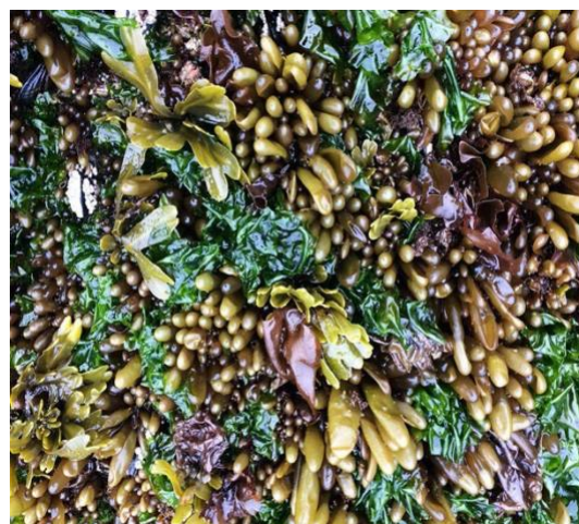
Many species of seaweed compete for space.

Olympic Coast National Marine Sanctuary protects a variety of habitats that sustain a diversity of species. Sanctuary waters include intertidal, kelp forest, rocky reef, open-ocean, and deep-sea habitats. Twenty-nine species of marine mammals and numerous species of seabirds reside in, or migrate through, this important protected area. Gray whales visit the sanctuary during their long migration, the longest mammal migration on Earth, and albatross gather food in sanctuary waters to then return to their chicks in nesting grounds in the mid-Pacific. The cold, nutrient-rich waters of the Olympic Coast support some of the most productive fisheries in the world. Salmon, halibut, and hake are some commercially important species found in sanctuary waters. Abundant shoals of small fish, which feed on readily available plankton, supply food for the larger predators in this complex food web. The sanctuary is also home to an incredible diversity of invertebrates, many of which serve important ecosystem functions in their role as decomposers. Some species, like razor clams and Dungeness crabs, are also commercially important. However, the most