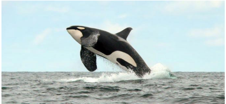
An orca swims through Olympic Coast National Marine Sanctuary.

PADI, SSI, NAUI, Ocean Literacy Principles 1 & 5, and Climate Literacy Principles 3 & 7