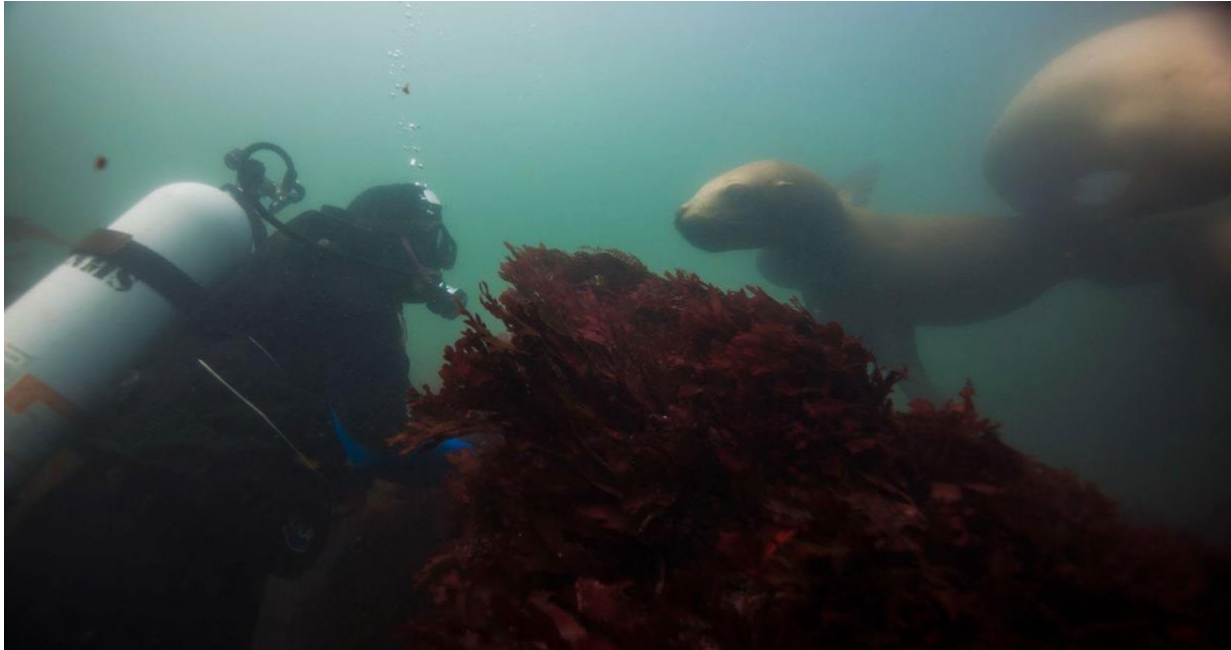
A diver comes face-to-face with a curious sea lion in Olympic Coast National Marine Sanctuary. While it's important to always give sea lions and other marine mammals plenty of space, these gregarious pinnipeds will often approach divers.