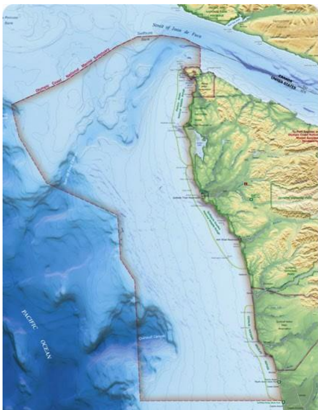
Atlas map of the Washington state coastline and Olympic Coast National Marine Sanctuary.

ocean places. Healthy aquatic ecosystems, whether fresh, brackish, or marine, are the basis for many cultures, as well as thriving recreation, tourism, and commercial activities that drive coastal economies.