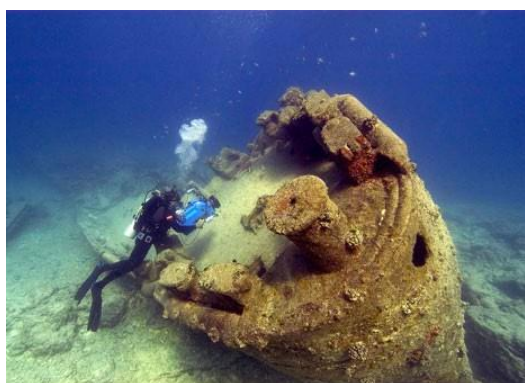
The USS Macaw ran aground at Midway during WWII while attempting to rescue a submarine. A diver filming the bow of the USS Macaw at Midway Atoll.

Papahānaumokuākea is also home to a variety of post-Western-contact historic resources, including those associated with the Battle of Midway, widely considered the turning point in the Pacific campaign of World War II, and with 19th-century commercial whaling. There are hundreds of reported lost shipwrecks and aircraft within monument waters, many of which have been explored.