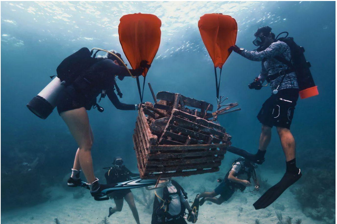
NOAA divers using lift bags to remove derelict fishing gear.

Heavy objects, more than 10lbs, should be removed with a lift bag. One should not use their BCD to bring heavy objects to the surface. If one accidentally drops the object when using a BCD to offset the object's weight, one will be at risk of an uncontrolled ascent. The lift of an object should never supersede the importance of maintaining good buoyancy and a safe ascent rate.