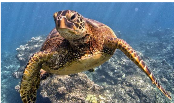
Hawaiian green sea turtle at Pearl and Hermes Atoll.

Papahānaumokuākea Marine National Monument provides protection for a tremendous amount of biodiversity. The monument's reefs are arguably the healthiest and least disturbed on the planet and possibly the last remaining predator-dominated reef ecosystem to exist. The region provides nesting and foraging grounds for approximately 14 million seabirds, representing 22 species, making it the