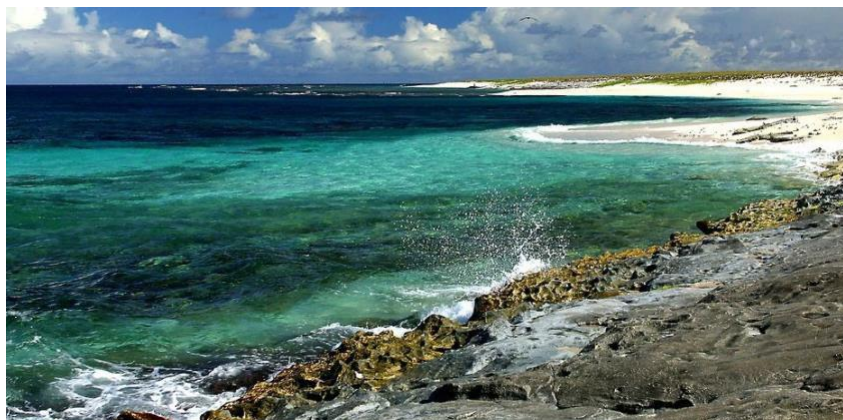
The beach and reef at Laysan Island in Papahānaumokuākea Marine National Monument.