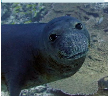
A Hawaiian monk seal.

PADI, SSI, NAUI, Ocean Literacy Principles 1 & 5