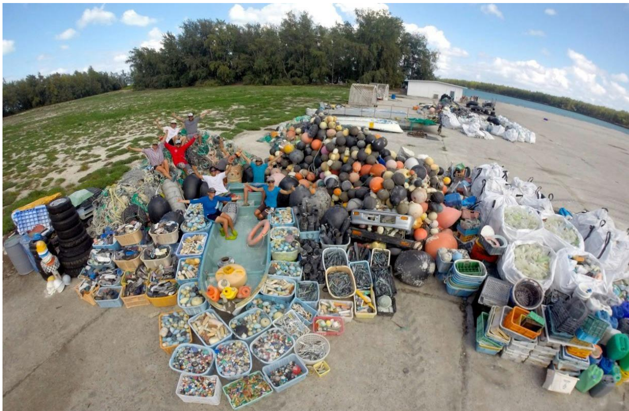
In 2016, the NOAA Marine Debris team removed 1,268 flip-flops from the shorelines of Midway Atoll.