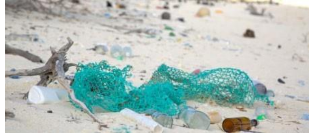
Marine debris in Papahānaumokuākea Marine National Monument.

Marine debris is defined as any persistent, manufactured solid material that is directly or indirectly, intentionally or unintentionally, disposed of or abandoned into the marine environment or the Great Lakes. The majority of marine debris comes from land-based sources, like storm drains and sewers, and coastal recreational activities. Some debris is ocean-based, like derelict fishing gear or trash lost from vessels.