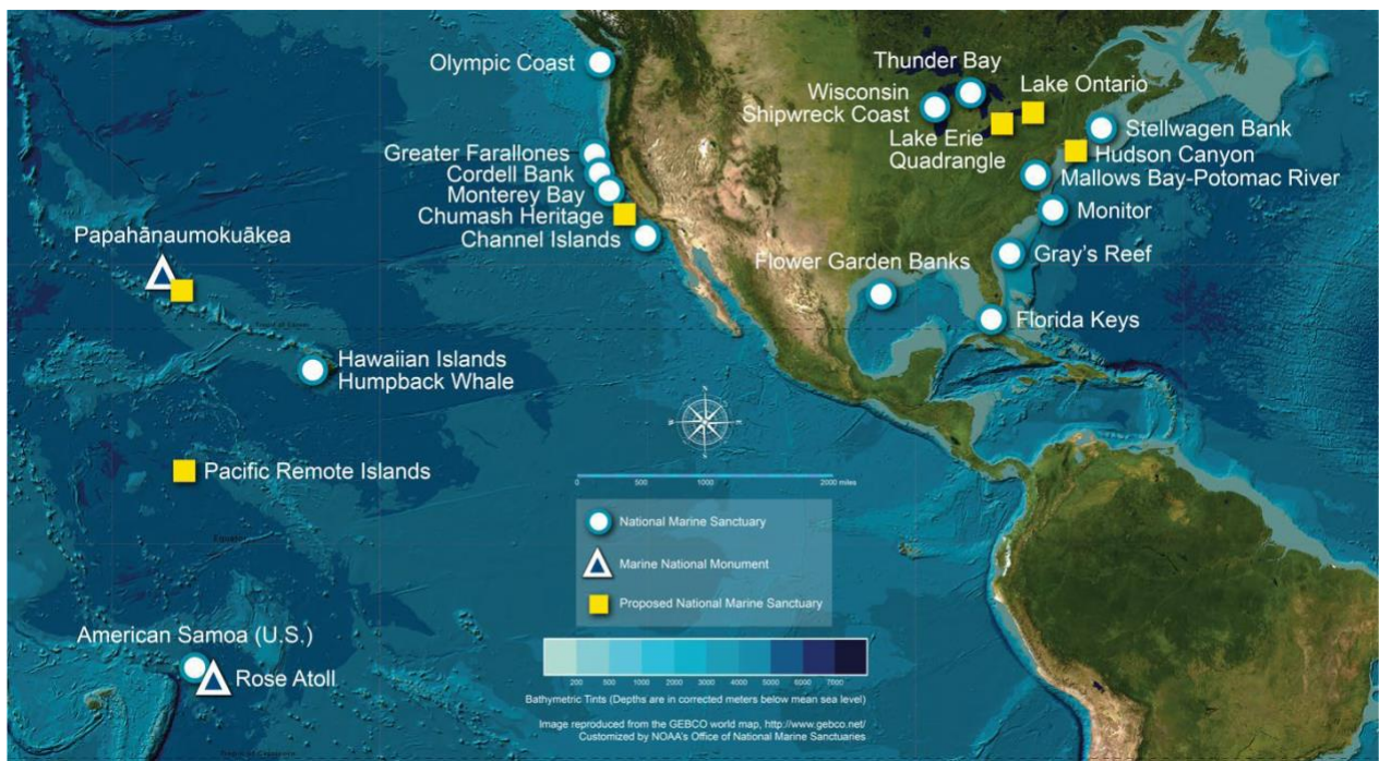
A map of the National Marine Sanctuary System in the U.S. and its territories.