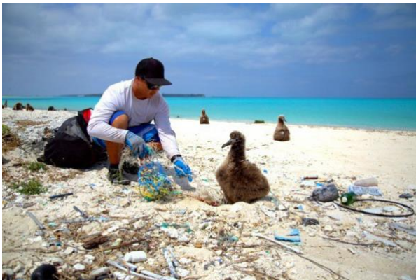
A NOAA Marine Debris team member disentangling a Laysan albatross chick from a small derelict fishing net.

Much marine debris is made from plastic, which is long-lasting in the environment, sometimes taking hundreds of years to break down. Large pieces of marine debris entangle and kill a significant number of animals every year. As plastics decay, they become microplastics, very small pieces 5mm or less in diameter, mostly invisible to the naked eye. Microplastics, and the toxins that adhere to them, are easily consumed by organisms either by passive uptake via filter-feeding or by active consumption when mistaken for food. Evidence of microplastics and associated toxins have been found in the tissues of a variety of organisms, including humans. Consumption of plastics, including microplastics, by wildlife has been shown to block digestive tracts, diminish the urge to eat, and alter feeding behavior, all of which can lead to death.