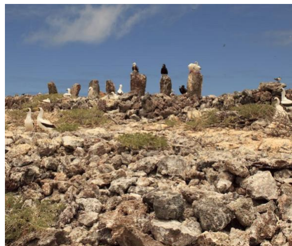
The island of Mokumanamana has the highest concentration of cultural sites in Hawaii with 34 document heiau, or sacred sites, most of similar design and whose purpose is yet to be determined.

Papahānaumokuākea Marine National Monument also protects many important aspects of Hawaiian culture. The first discoverers of the Hawaiian Archipelago, Native Hawaiians, inhabited the islands for thousands of years prior to Western contact. Even the remote Northwestern Hawaiian Islands were explored, colonized, and, in some cases, settled by Native Hawaiians during pre-contact times. Radiocarbon data estimates that Nihoa and Mokumanamana were inhabited between 1000 to 1700. Native Hawaiians continue to maintain strong cultural ties to the ocean, seeing it as a source of resources, as well as physical and spiritual sustenance. In Hawaiian traditions, the Northwestern Hawaiian Islands are considered a sacred place, the region from which life springs and spirits return after death. The monument contains significant cultural sites. Mokumanamana has the highest concentration of heiau (spiritual altars) of anywhere in the archipelago and Nihoa is a training location for apprentice navigators learning the ancient skill of way-finding (navigating without instruments).