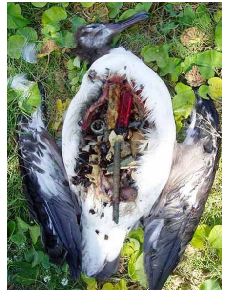
Laysan albatross chick full of plastic marine debris on Kure Atoll State Wildlife Refuge.

NOAA and its partners are working hard to reduce marine debris in Papahānaumokuākea. Marine debris is removed from monument waters and shoreline clean-ups are conducted regularly. Scientists with special permits work to disentangle impacted organisms. Since 1994, over 900 tons of marine debris have been removed from the monument. That's equivalent to more than 200 elephants! People can help reduce marine debris by being planet-friendly consumers. One can consider reducing reliance on single-use plastics and being mindful of packaging. Proper recycling and waste disposal also reduces marine debris. Lastly, people can help educate others about the problem of marine debris and its potential solutions.